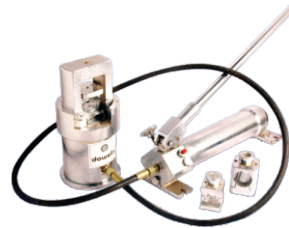
SYE - 150A