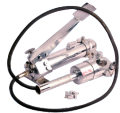
SYT 102 R