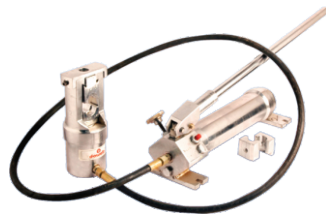
SYD - 20A