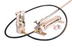
SYD - 20