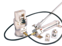
SYE - 150